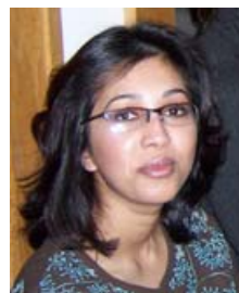
Lubna Shabnam Jahurul Islam Medical College