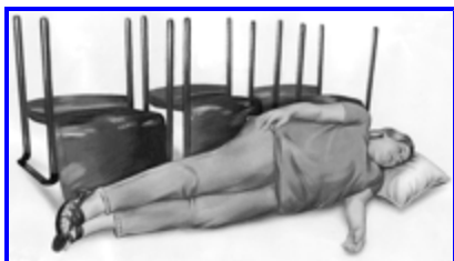
Figure 3. Figure. Left lateral position for pregnant woman.

View this table: Table 1. Clinical Factors Associated With Submersion Mortality [in this window] [in a new window]