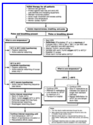
Figure 1. Figure. Hypothermia treatment algorithm.

The Figure 5A presents a recommended hypothermia treatment algorithm with recommended actions that should be taken for all possible victims of hypothermia.