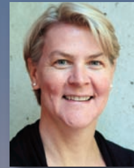
Mary Malotky Primary Clinic