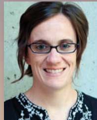
Kate Pfaff Primary Clinic: Brooklyn Park, HFC-EL