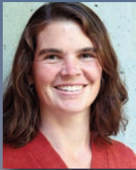
Julia Cross Primary Clinic: Richfield, HCMC