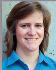
Karlyn Peterson Primary Clinic: Brooklyn Park, HCMC