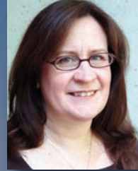
Kathy Leggitt Primary Clinic: Brooklyn Park, HCMC